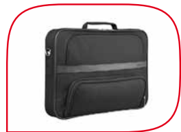
Laptop Case XL 17.3" , PX1781E-1NCA