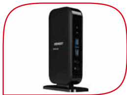
dynadock V3.0, PA5082E-1PRP