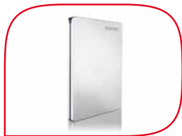
STOR.E SLIM 2.5 500GB USB 3.0 silver, HDTD105ES3D1